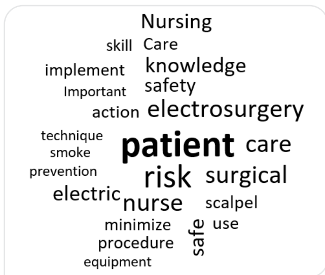
Figure 2. Word cloud.